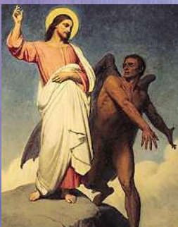
THE SPIRIT DROVE JESUS OUT INTO THE DESERT, AND HE REMAINED IN THE DESERT FOR FORTY DAYS, TEMPTED BY SATAN Mk 1:12-15

TODAY'S GOSPEL TELLS US OF THE TEMPTATION OF JESUS AND HIS FASTING IN THE DESERT FOR FORTY DAYS. AFTER MASS, DISCUSS THE READING WITH YOUR CHILDREN, EXPLAINING THAT TEMPTATION ITSELF IS NOT A SIN AND AS CHRIST DID, WE MUST USE THE WORD OF GOD TO COMBAT TEMPTATION.